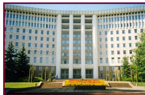
Chisinau (Kishinev) - Parliament Building of Moldova

GLC wish everyone a safe trip home and we hope you enjoyed your program in NW Ohio!