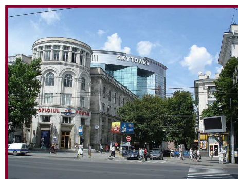
Chisinau (Kishinev) - “Oficiul Postal and Skytowel” building