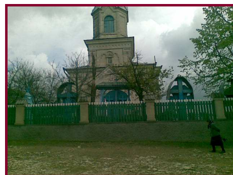
Glodeni - “Biserica din Balatina”