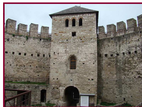
Soroca - Tower with gate of the fortress